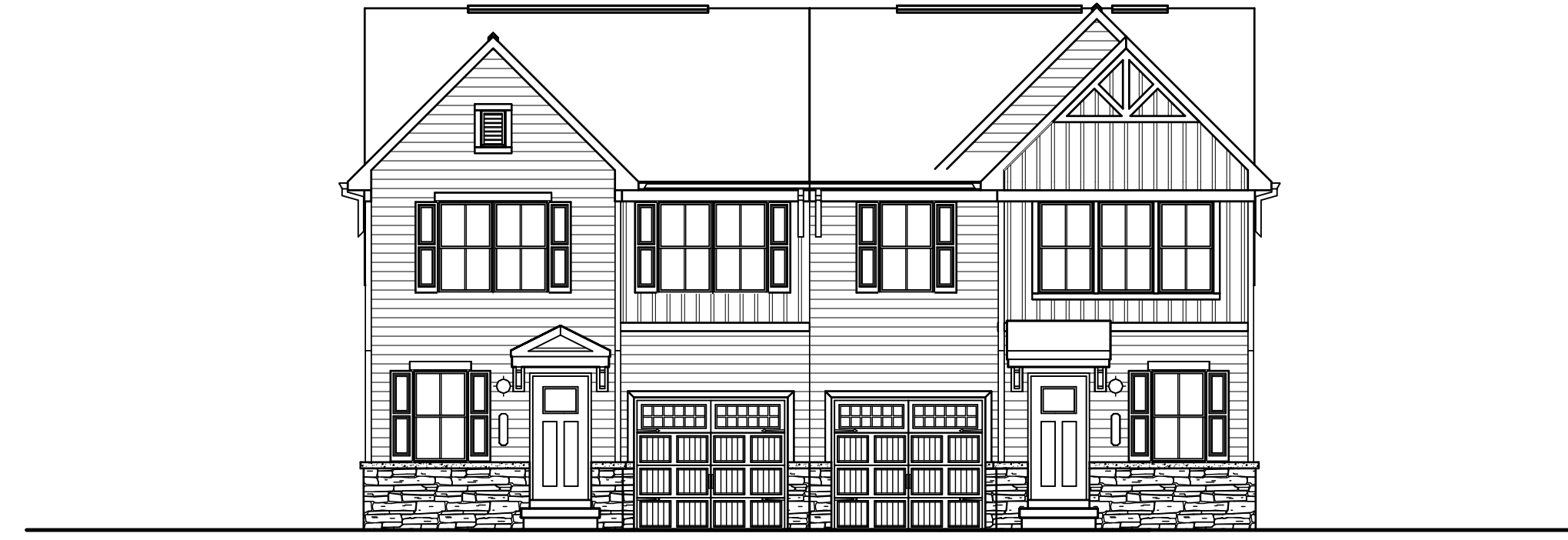
UNIT B ELEVATION "K" (PER PLAN)