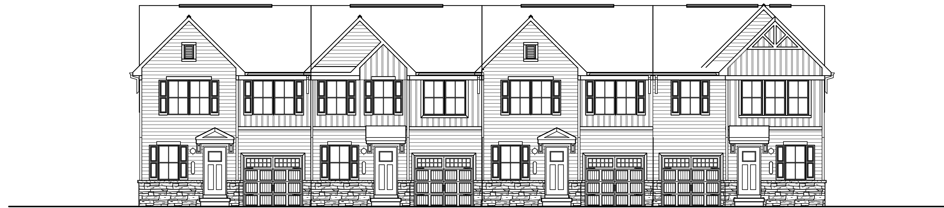
UNIT D ELEVATION "K" (PER PLAN)